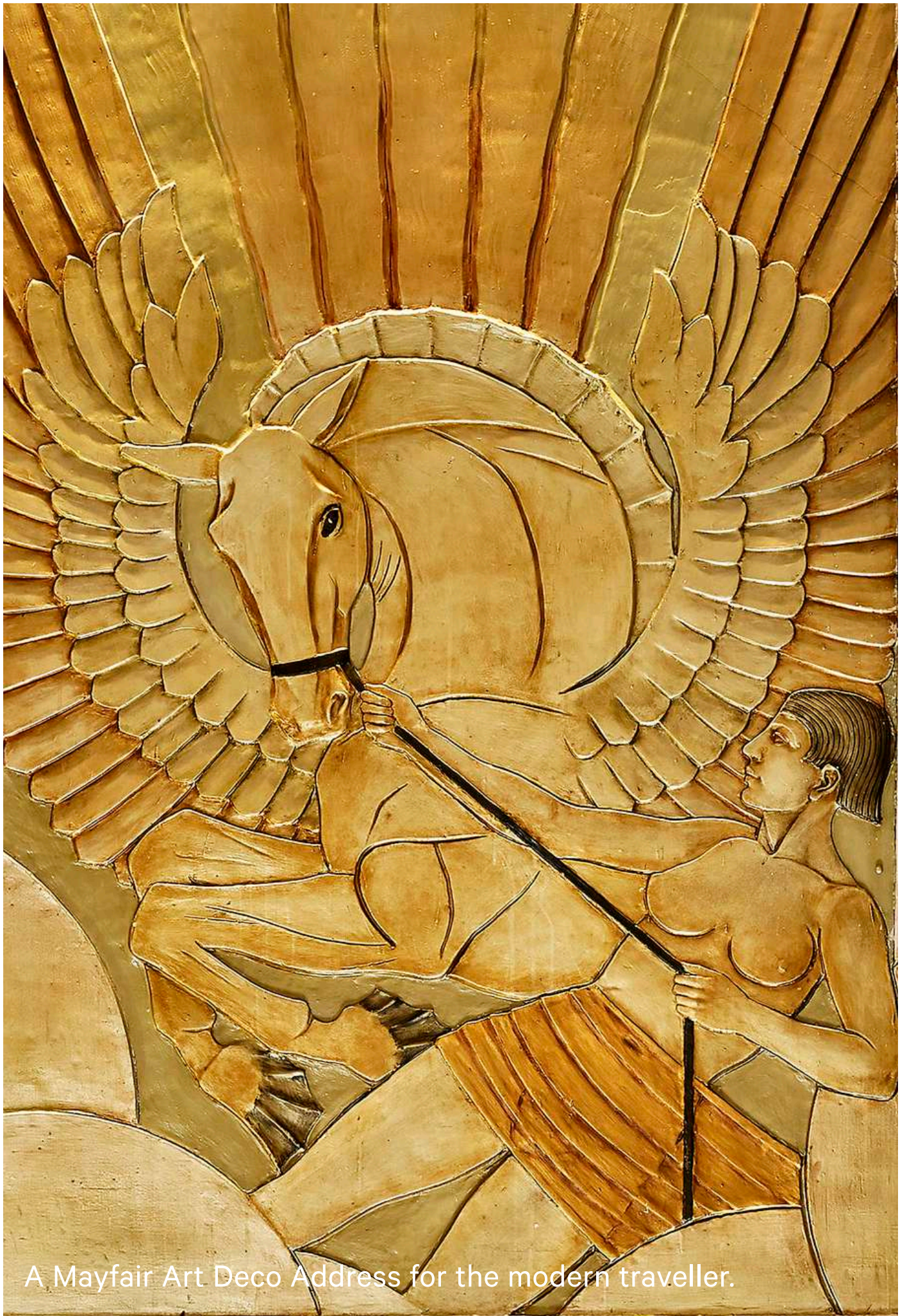
A Mayfair Art Deco Address for the modern traveller.